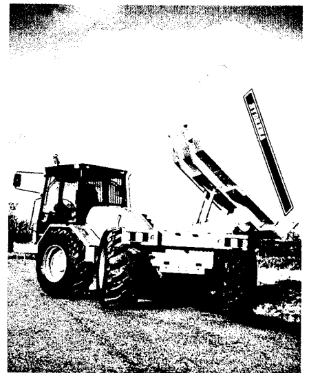
The 912 is available with multitip.

123 hp Perkins turbo charged diesel engine with intercooler fullfilling the new strict EEC stage 1 regulations.