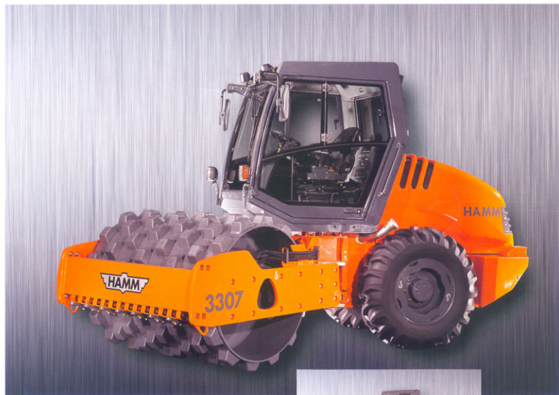
Machine équipée d'options